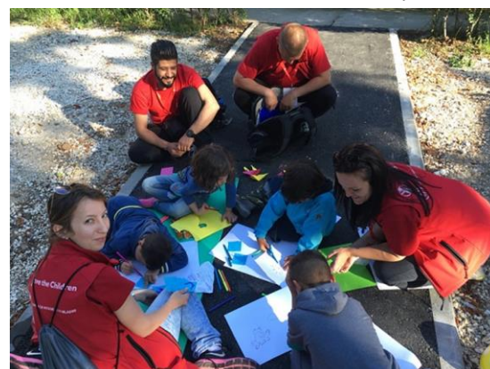
Preševo RC: Save the Children organized recreational activities