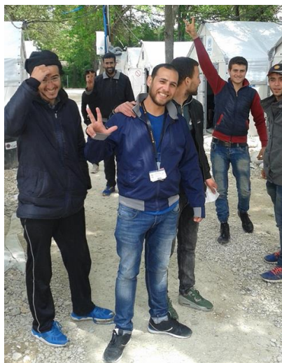
Preševo: A Syrian man residing in RC Preševo for three months, Photo©UNHCR