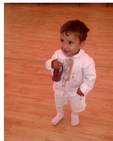
Preševo RC: An Afghan girl enjoying cocoa milk 3 hours upon arrival to with her family