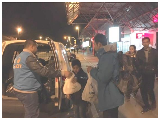
Subotica: Distribution of aid to refugees arriving at bus station, Photo@HCIT