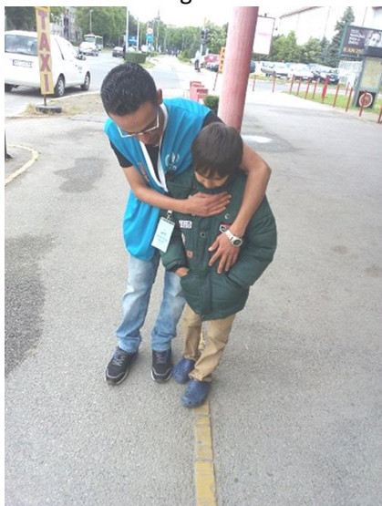
Subotica: HCIT team member consoling a frightened boy who got temporarily separated from his family,