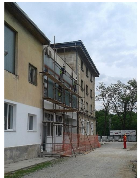
Preševo: Phase III of restoration of former Tobacco factory, Photo@UNHCR