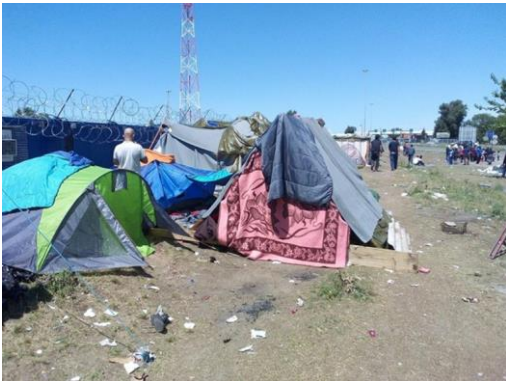
Northern border: Refugees waited in improvised shelters without sanitary facilities to enter Hungary through "transit zones"