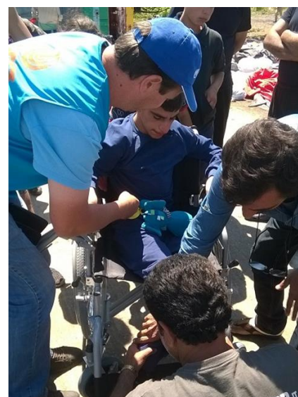
Kelebija: Disabled asylum-seeker was provided with a wheelchair