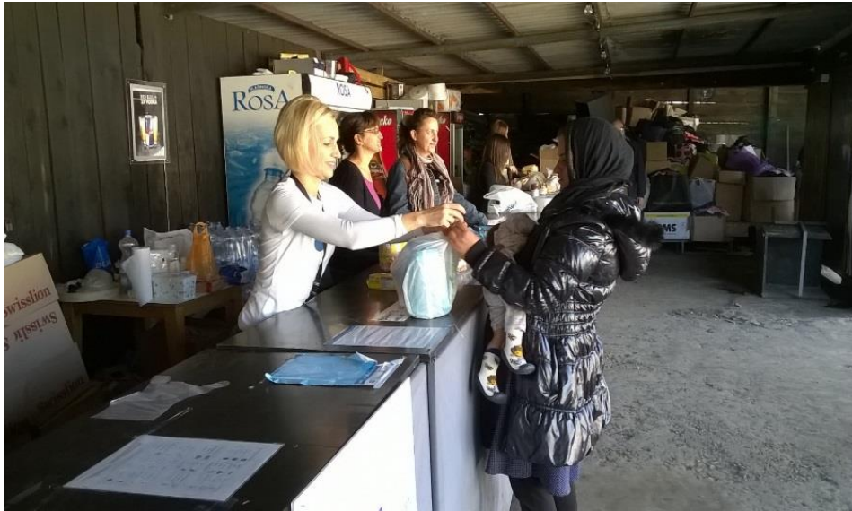
Foundation Ana and Vlade Divac staff distributing NFIs at Miksalište in Belgrade