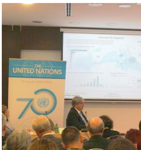
UNCT Partners' Briefing, Hotel INN Belgrade, 12 October 2015