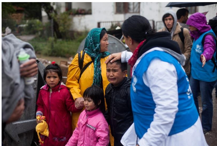
Refugees awaiting registration outside Preševo One Stop Centre