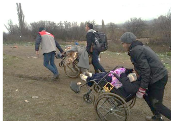
DRC protection staff assisting refugees arriving in Miratovac from FYR Macedonia