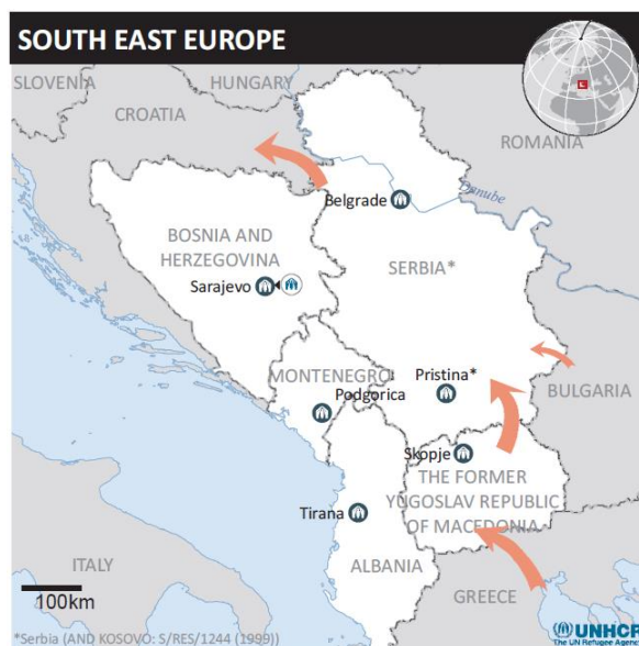
*Serbia (AND KOSOVO: S/RES/1244 (1998)) Printing date: September 2015 Sources: UNCS, UNHCR The boundaries and names shown and the designations used on this map do not imply official endorsement or acceptance by the United Nations.