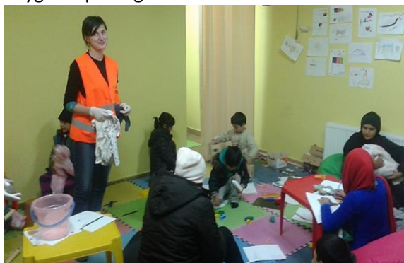
Adaševci - Czech volunteer and refugee children in the child friendly space