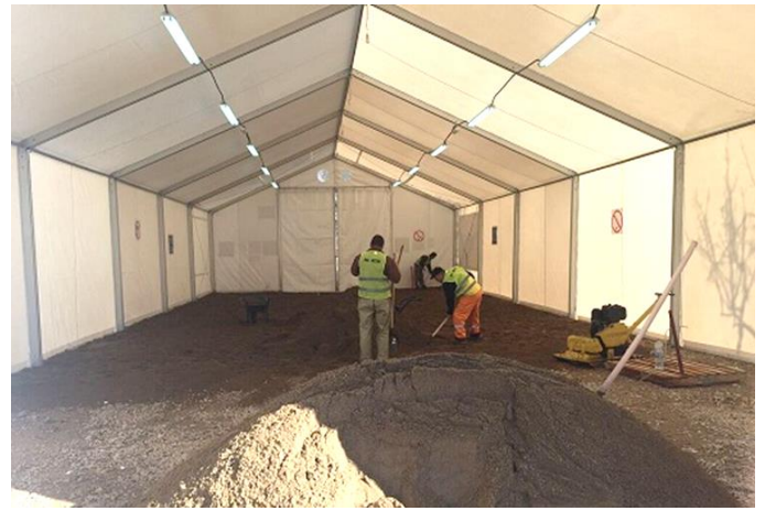
Preševo - Levelling the surface inside one of the UNHCR rub halls