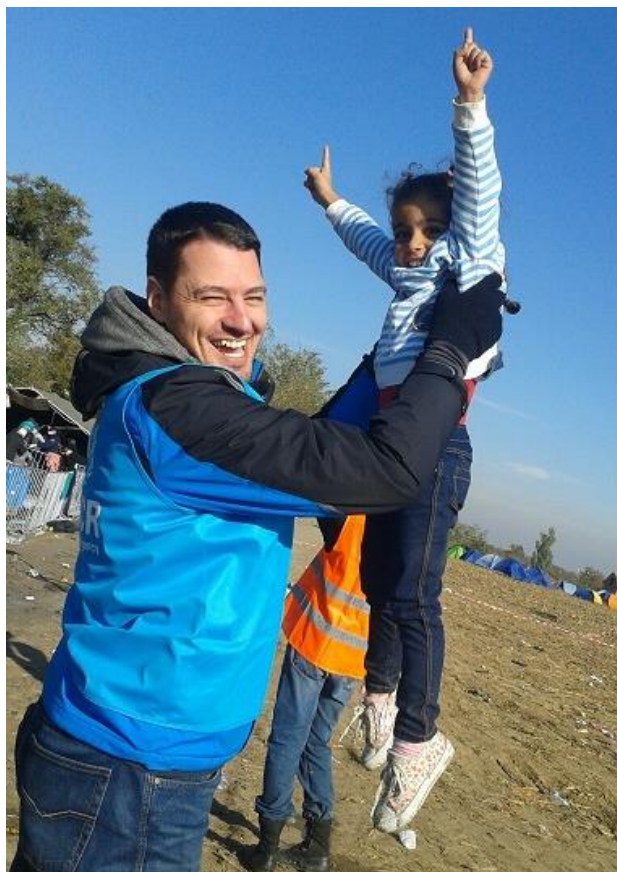
BERKASOVO – Syrian girl waiting with her family (not pictured) to cross (2 November), Photo: @UNHCR