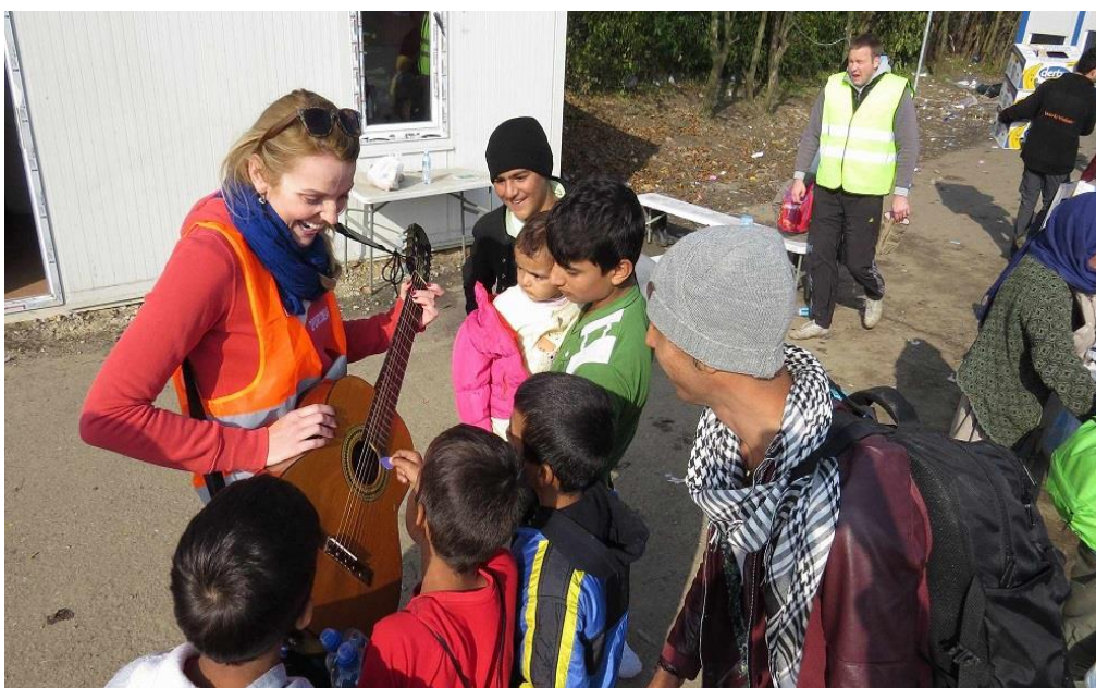
Berkasovo – A hearty volunteer attempting to lift the spirits of refugees waiting to be admitted to Croatia (28 October)