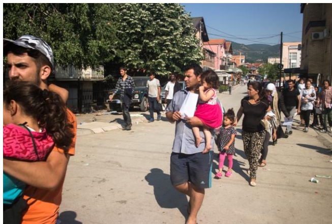
Refugees arrive to Preševo in south Serbia after a long journey