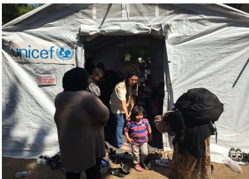
Child-friendly space in Preševo One Stop Centre

The Serbian government is continuing to provide refugees with humanitarian assistance as well as registration documents.