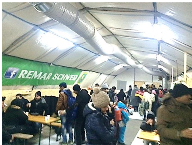
Preševo - Winterized REMAR tent where refugees can warm up with soup and tea