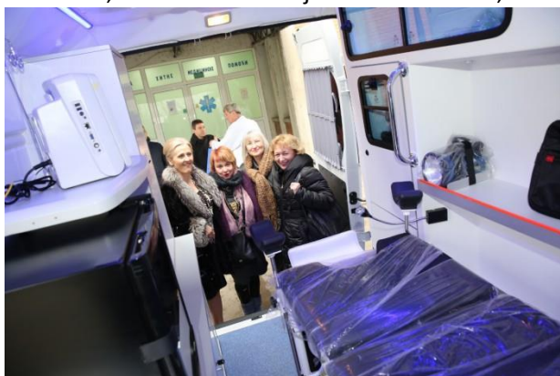
Šid -Health Center in Šid received a mobile clinic donated by UNFPA