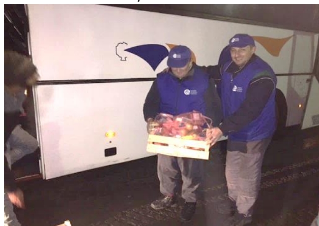
Šid - Ecumenical Humanitarian Organization (EHO) staff distributing food