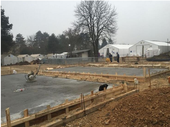
Preševo - Preparation of the pre-registration roofed area