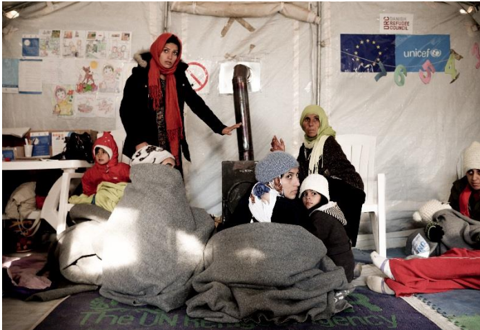
Many refugee and migrant children and their families are facing harsh weather conditions. Thanks to the generous support from the European Union's Humanitarian Aid and Civil Protection Department (ECHO), they can keep warm in the UNICEF-supported child-friendly space in Preševo and receive warm winter clothes which will help them to weather the upcoming winter