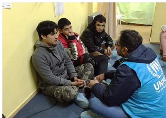
Šid - UNHCR staff talking with Afghan minors in the RAP, Photo ©UNHCR